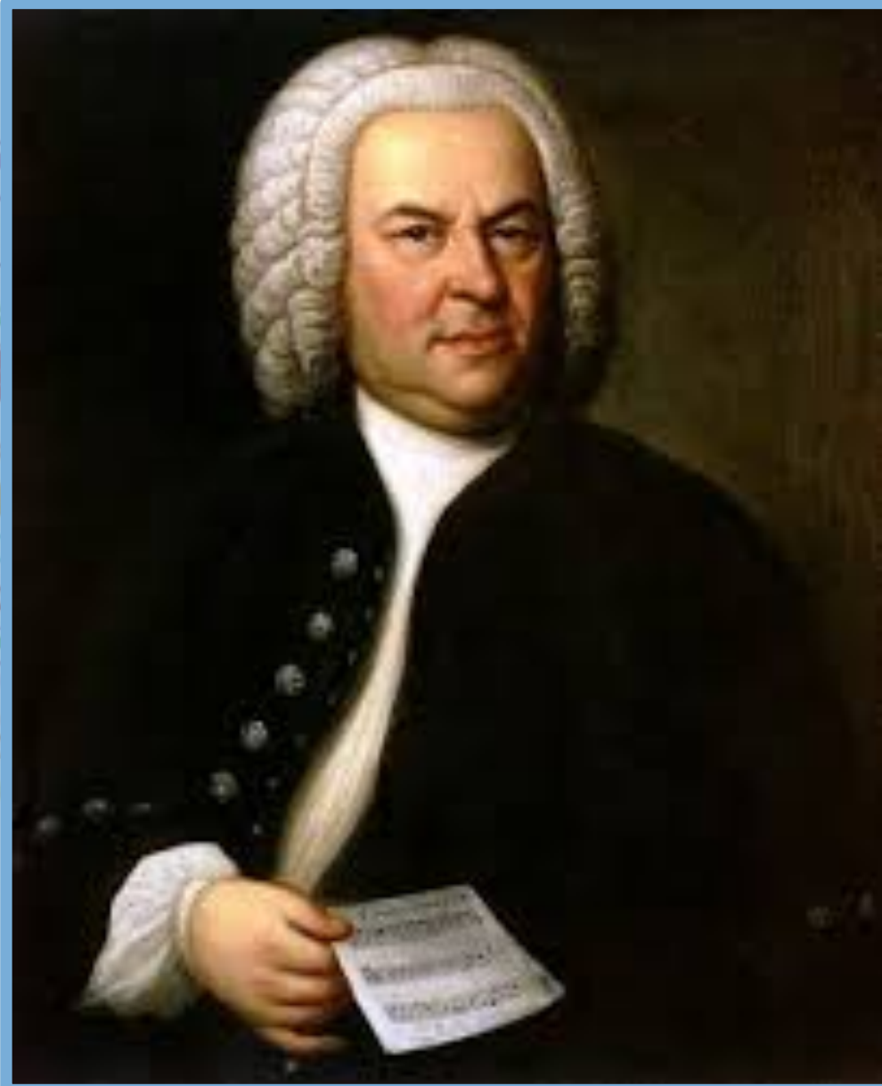
Johann Sebastian Bach