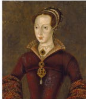
Lady Jane Grey