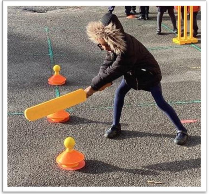
Year 6 enjoying Cricket Coaching sessions.